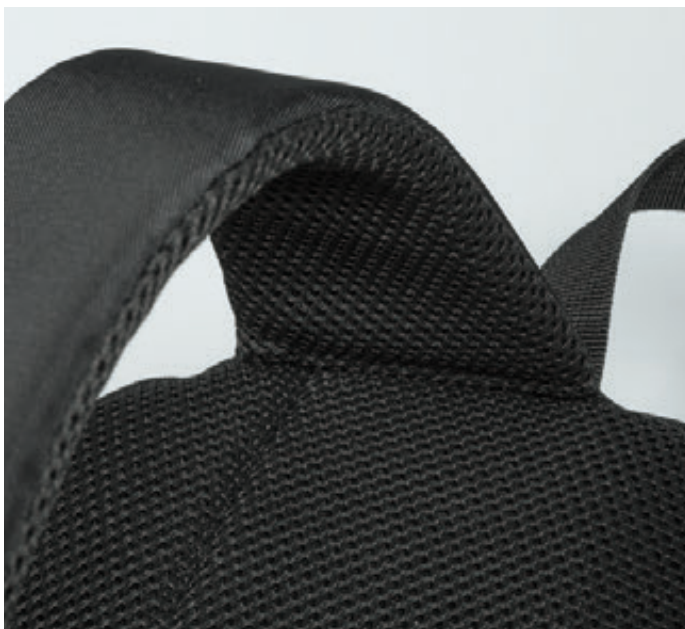
foam-padded back panel