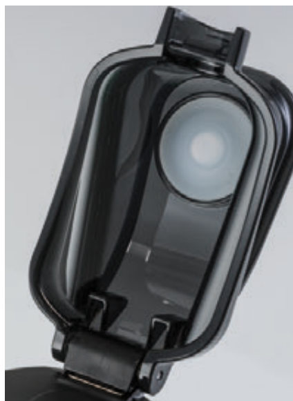
one click opening