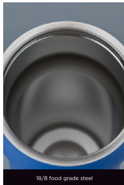
18/8 food grade steel