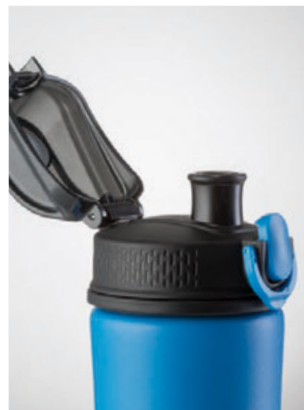
double lock cap