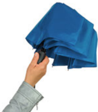
Step 1: press the button to open