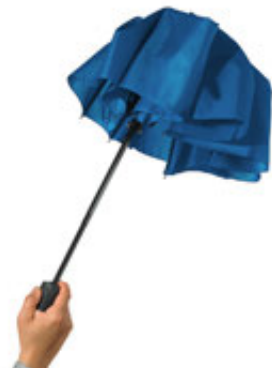
Step 3: press the button to close