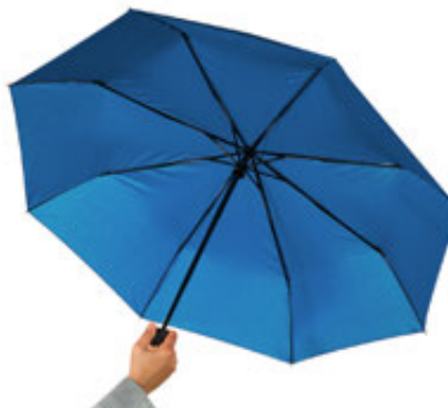
Step 2: umbrella is open