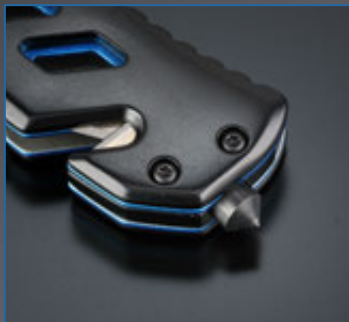
WINDOW BREAKER & BELT CUTTER