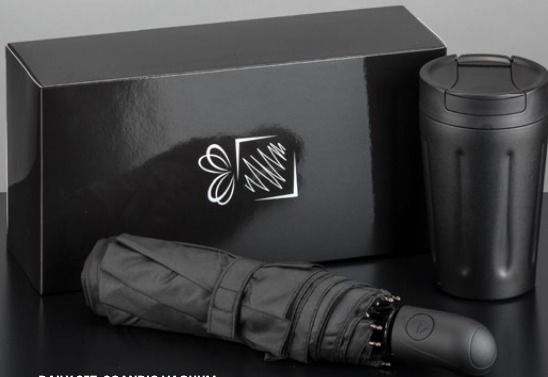
DAILY SET: SCANDIC VACUUM COFFEE MUG, 350 ML AND CAMBRIDGE UMBRELLA ZS11