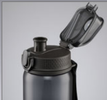
ONE CLICK OPENING