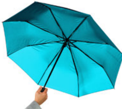
Step 2: umbrella is open