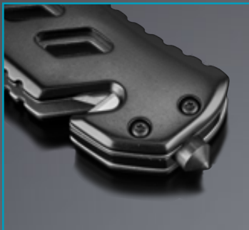
WINDOW BREAKER & BELT CUTTER