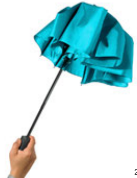
Step 3: press the button to close