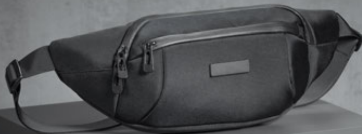
BIZZ PRO WAIST BAG LNN450