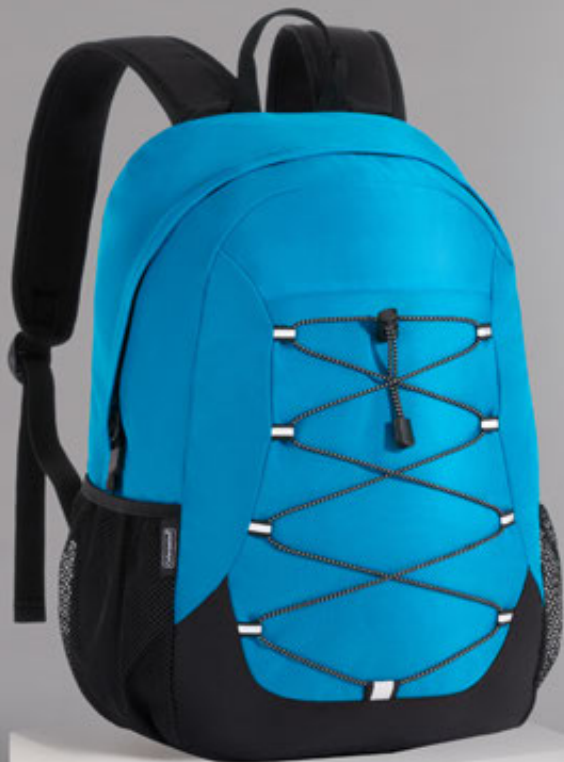
NORDIC TWO-COMPARTMENT BACKPACK 15" LPN320