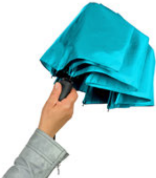
Step 1: press the button to open