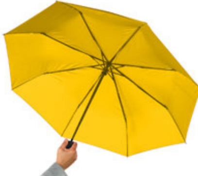
Step 2: umbrella is open