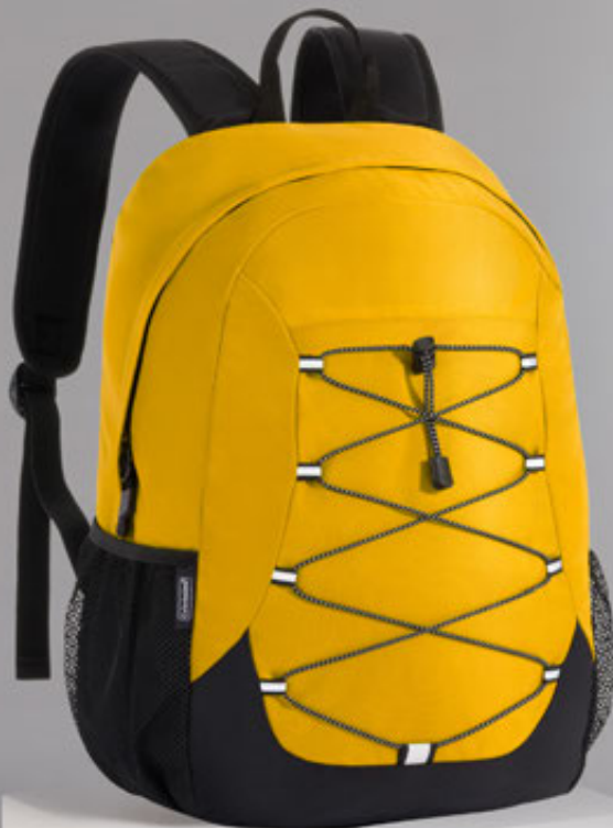
NORDIC TWO-COMPARTMENT BACKPACK 15" LPN320