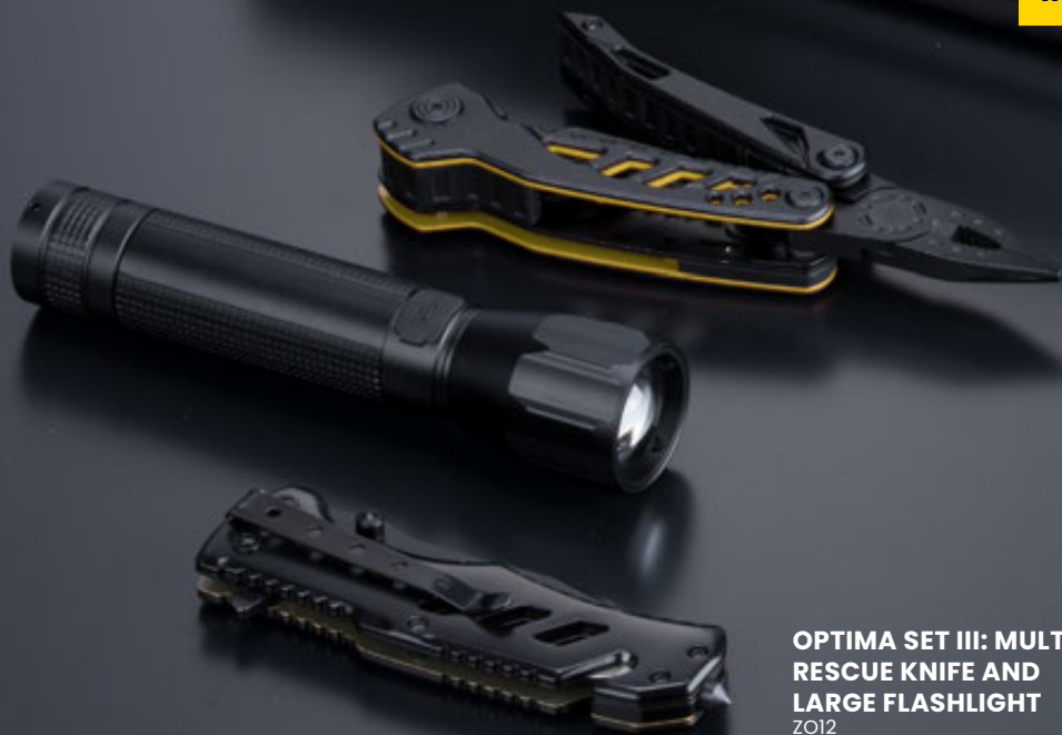
OPTIMA SET III: MULTITOOL, RESCUE KNIFE AND LARGE FLASHLIGHT Z012