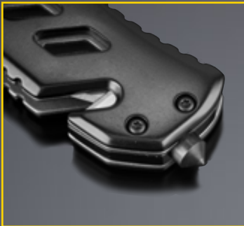
WINDOW BREAKER & BELT CUTTER