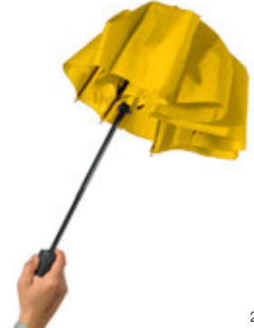
Step 3: press the button to close