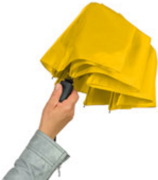
Step 1: press the button to open