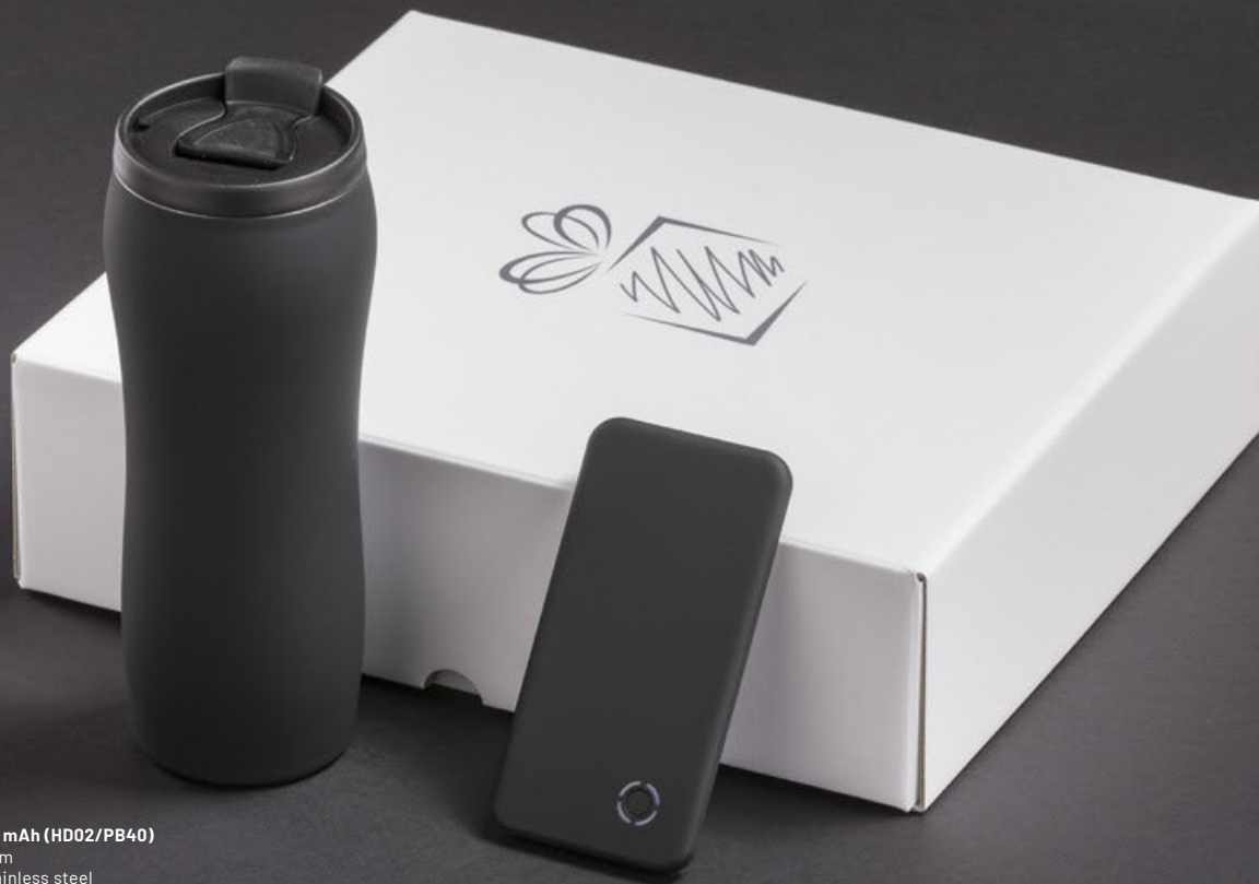
THERMAL MUG 450 ML & RAY POWER BANK 4000 mAh (HD02/PB40)