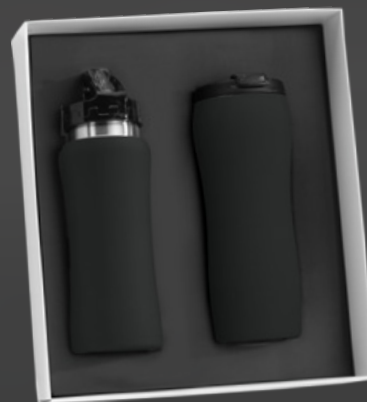
Drinkware set: Water Bottle, 600 ml. & Thermal Mug, 450 ml. HB01/HD02