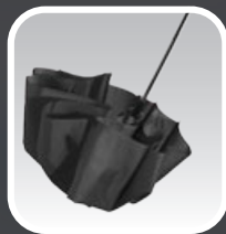
DAS system: 2. press the button to close