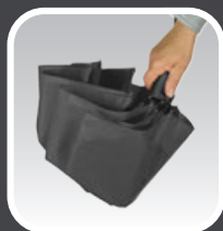
DAS system: 1. press the button to open