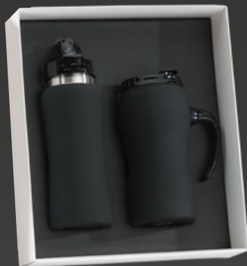
Drinkware set: Water Bottle, 600 ml. & Thermal Mug, 450 ml. HB01/HD01