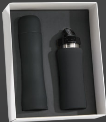
Drinkware set: Thermos, 500 ml. & Water Bottle, 600 ml. HT01/HB01