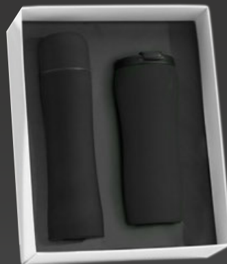
Drinkware set: Thermal Mug, 450 ml. & Thermos, 500 ml. HD02/HT01