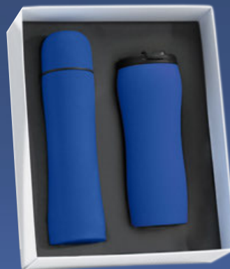
Drinkware set: Thermal Mug, 450 ml. & Thermos, 500 ml. HD02/HT01