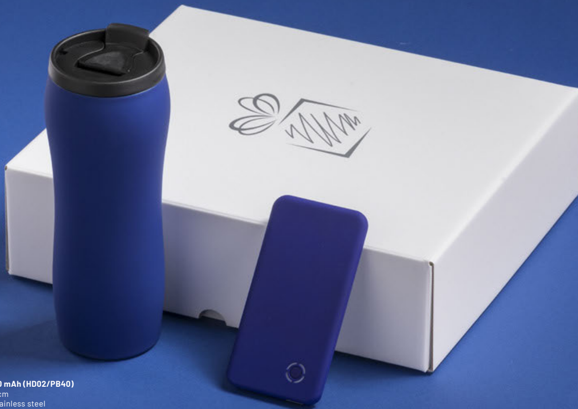
THERMAL MUG 450 ML & RAY POWER BANK 4000 mAh (HD02/PB40)