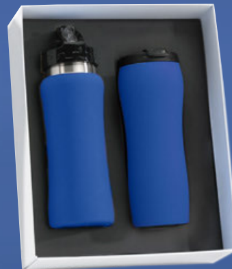
Drinkware set: Water Bottle, 600 ml. & Thermal Mug, 450 ml. HB01/HD02