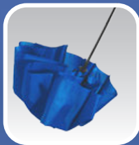
DAS system: 2. press the button to close