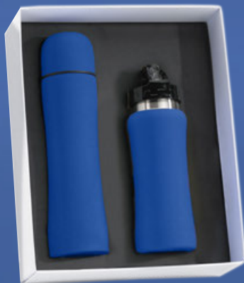
Drinkware set: Thermos, 500 ml. & Water Bottle, 600 ml. HT01/HB01