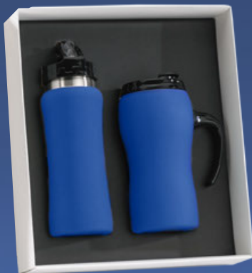
Drinkware set: Water Bottle, 600 ml. & Thermal Mug, 450 ml. HB01/HD01