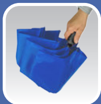
DAS system: 1. press the button to open