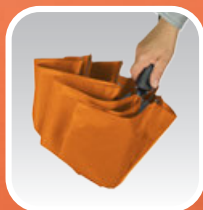
DAS system: 1. press the button to open