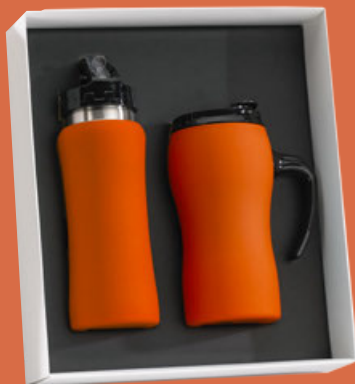
Drinkware set: Water Bottle, 600 ml. & Thermal Mug, 450 ml. HB01/HD01