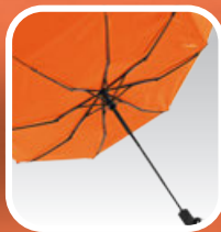
ANTI WIND system