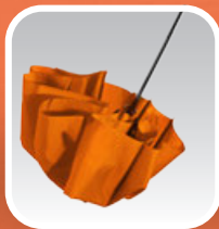
DAS system: 2. press the button to close