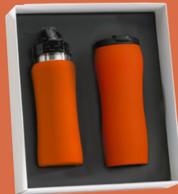
Drinkware set: Water Bottle, 600 ml. & Thermal Mug, 450 ml. HB01/HD02