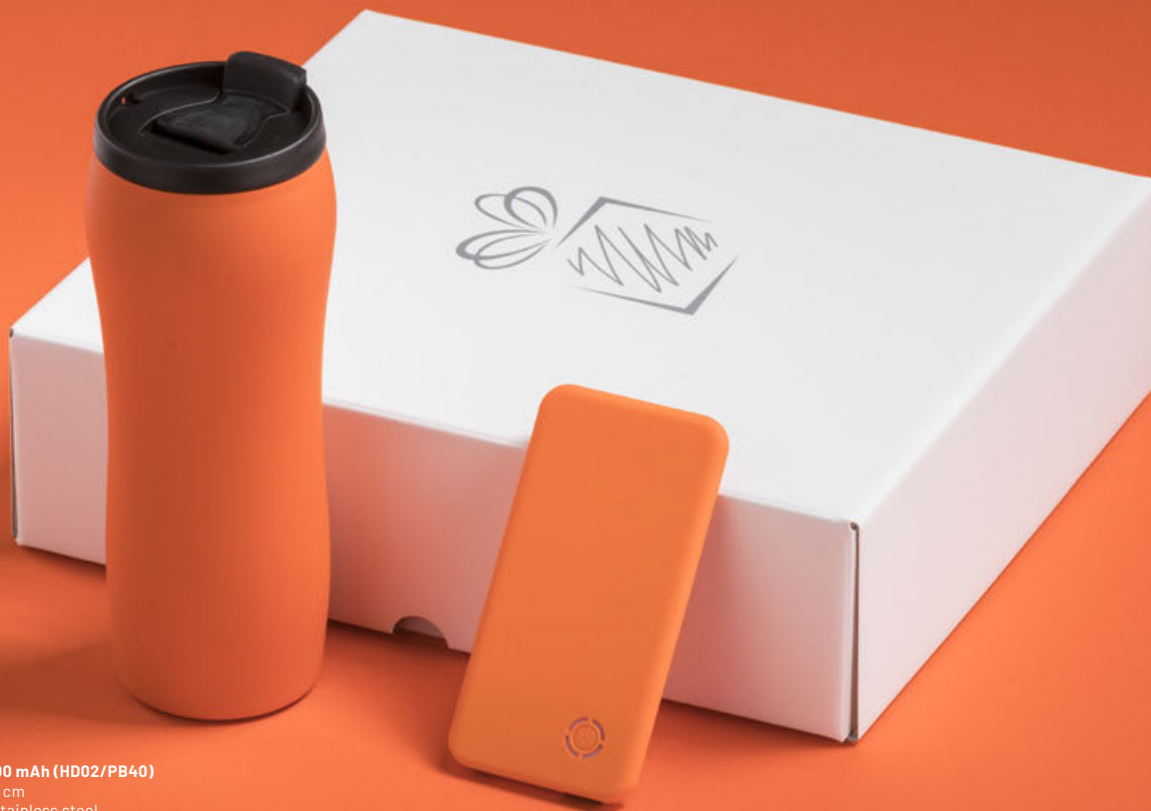
THERMAL MUG 450 ML & RAY POWER BANK 4000 mAh (HD02/PB40)