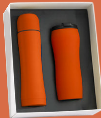
Drinkware set: Thermal Mug, 450 ml. & Thermos, 500 ml. HD02/HT01