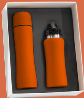
Drinkware set: Thermos, 500 ml. & Water Bottle, 600 ml. HT01/HB01