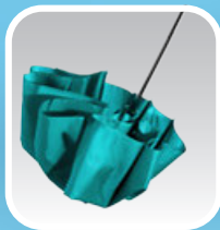
DAS system: 2. press the button to close