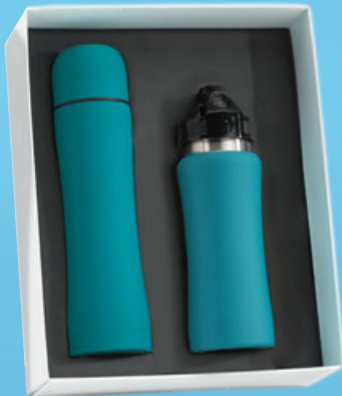
Drinkware set: Thermos, 500 ml. & Water Bottle, 600 ml. HT01/HB01