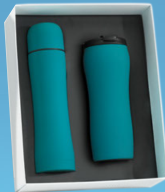
Drinkware set: Thermal Mug, 450 ml. & Thermos, 500 ml. HD02/HT01