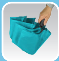
DAS system: 1. press the button to open