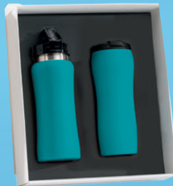
Drinkware set: Water Bottle, 600 ml. & Thermal Mug, 450 ml. HB01/HD02