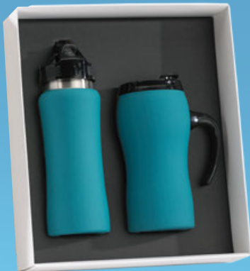
Drinkware set: Water Bottle, 600 ml. & Thermal Mug, 450 ml. HB01/HD01