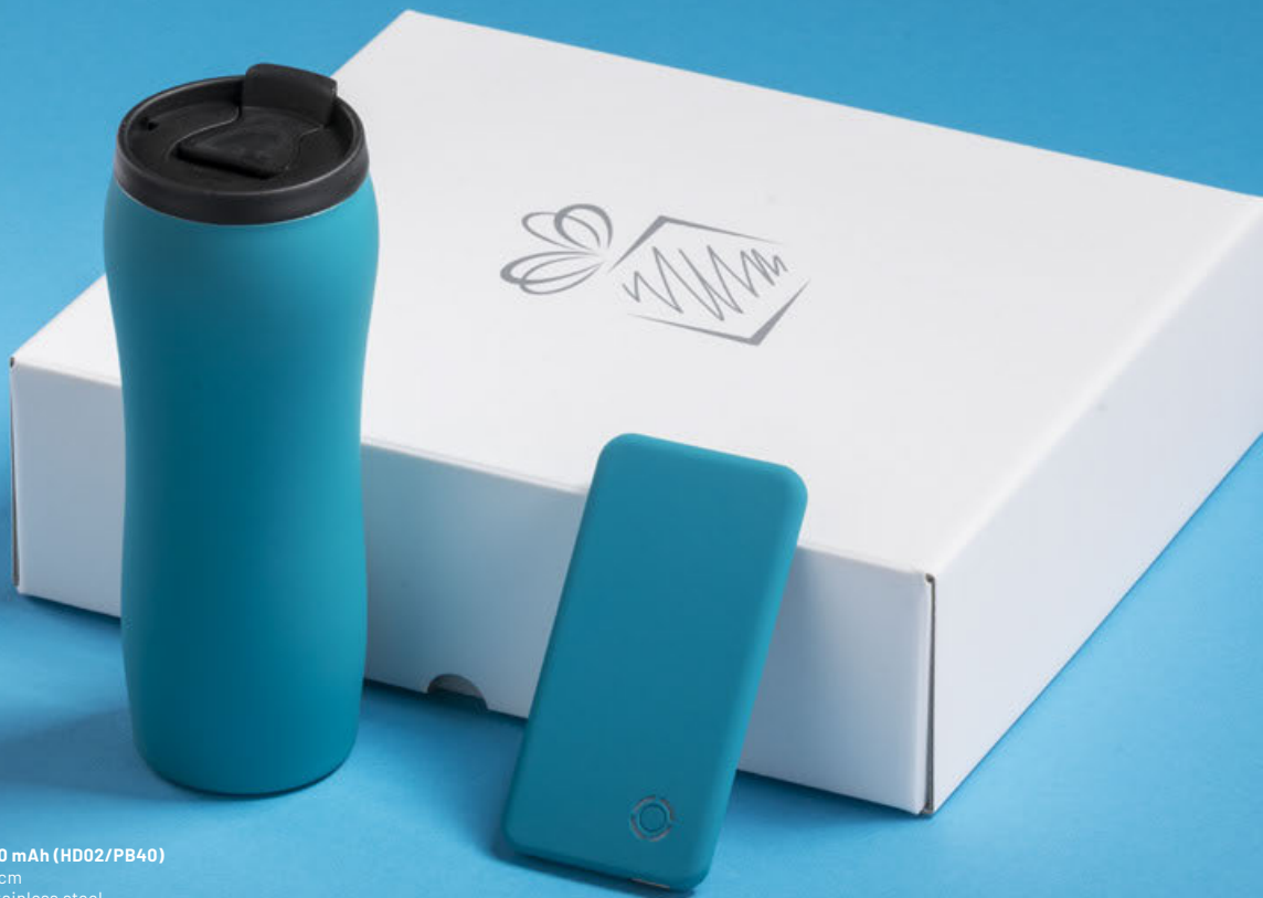
THERMAL MUG 450 ML & RAY POWER BANK 4000 mAh (HD02/PB40)