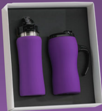
Drinkware set: Water Bottle, 600 ml. & Thermal Mug, 450 ml. HB01/HD01