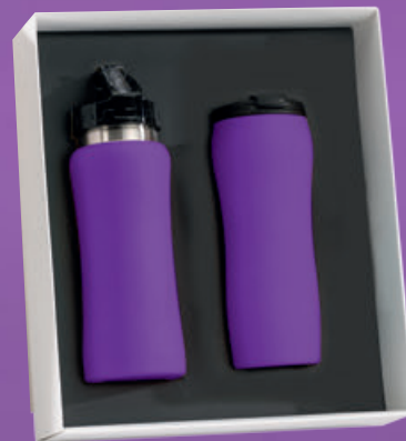
Drinkware set: Water Bottle, 600 ml. & Thermal Mug, 450 ml. HB01/HD02