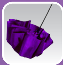
DAS system: 2. press the button to close