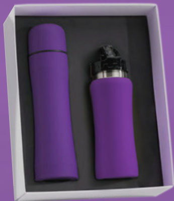
Drinkware set: Thermos, 500 ml. & Water Bottle, 600 ml. HT01/HB01