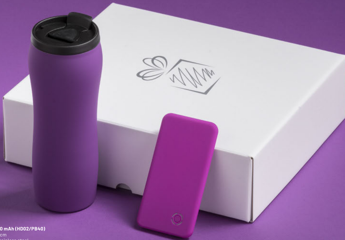
THERMAL MUG 450 ML & RAY POWER BANK 4000 mAh (HD02/PB40)