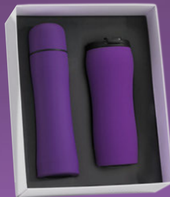
Drinkware set: Thermal Mug, 450 ml. & Thermos, 500 ml. HD02/HT01