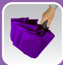
DAS system: 1. press the button to open